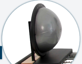
A2 CARDIO JUMP DOME