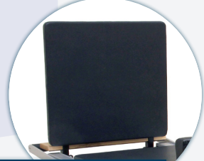
A2 JUMP BOARD