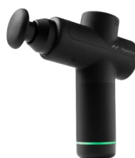
Hypervolt 2 Go