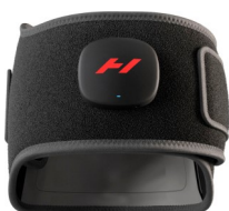
Venom 2 Back